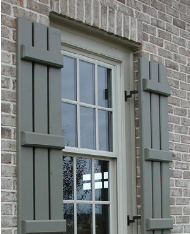
Tudor Board and Batten Shutters